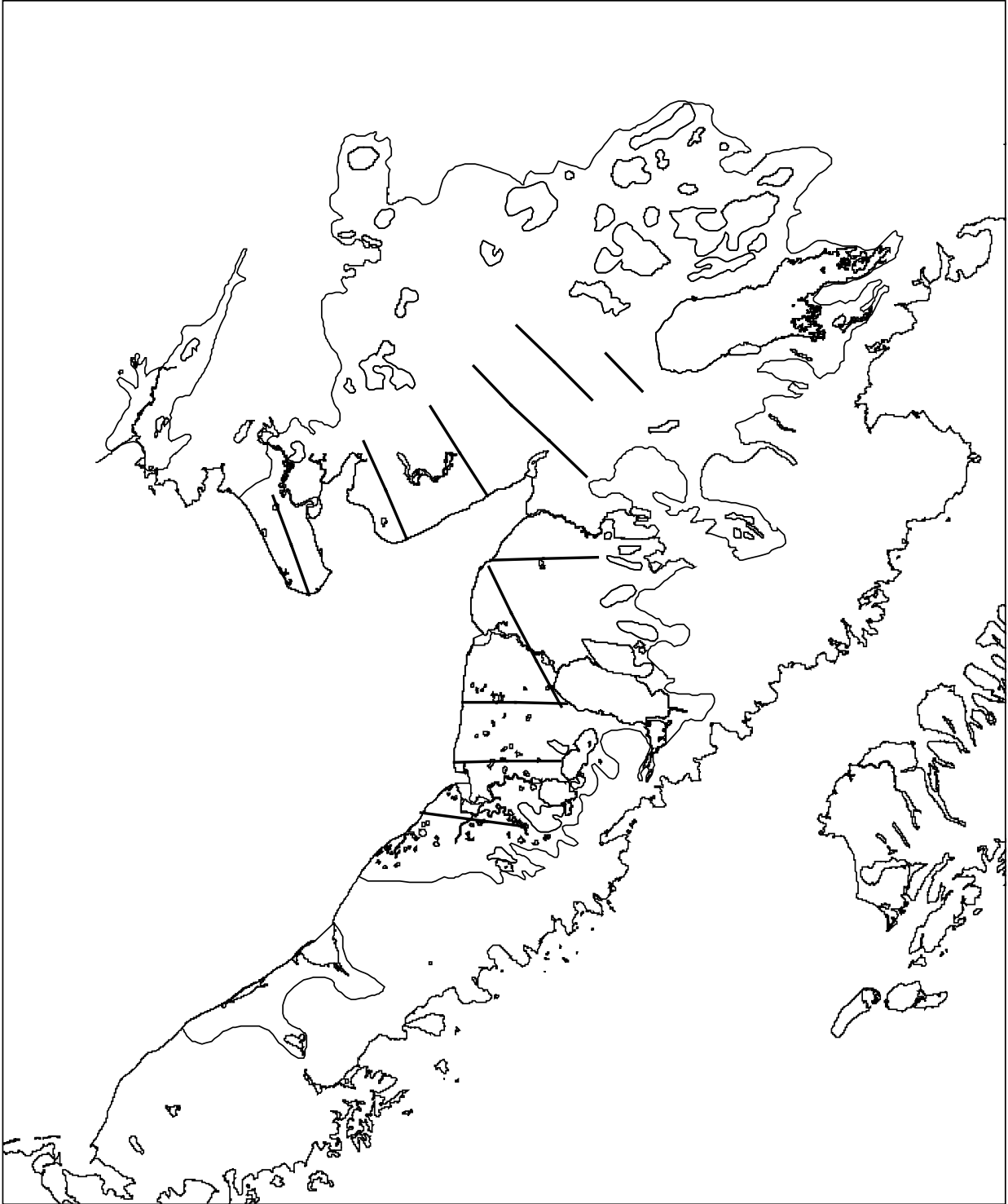
Figure 2. Location of traditional breeding pair survey flightlines.